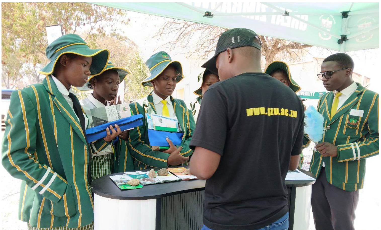
Masvingo Agricultural Show