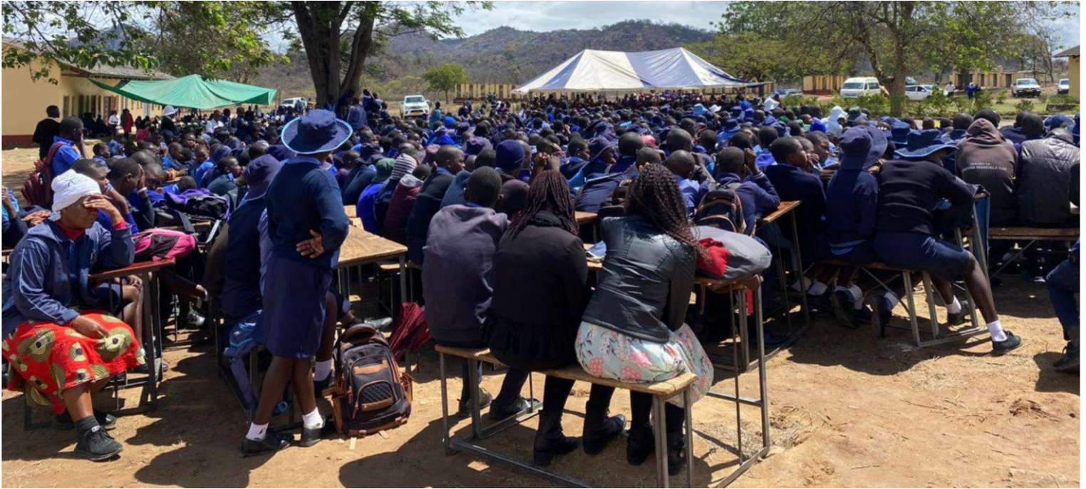
Tugwane Career Guidance