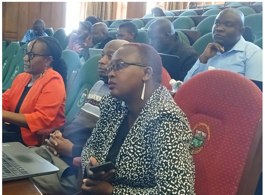
Delegates following proceedings

Members of staff from different schools within the University as well as library personnel were in attendance.