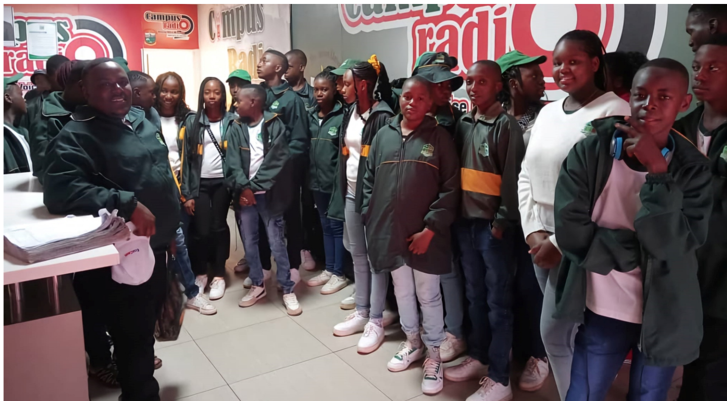
Waterfalls Academy students enjoy the Campus Radio experience