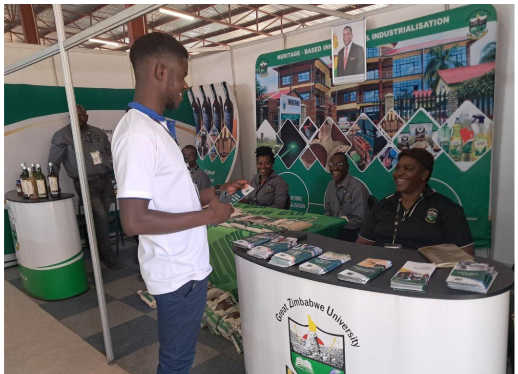
One on one interactions by the public with members of staff at ZAS

M oreso, the University was also part of the 114th edition of the Zimbabwe Agricultural Society and the Masvingo Agricultural Show exhibitions that came with numerous patrons having to visit the Great Zimbabwe University stand. The exhibitions provided a platform for the institution to interact with stakeholders and reaffirm its position as the University of Choice.