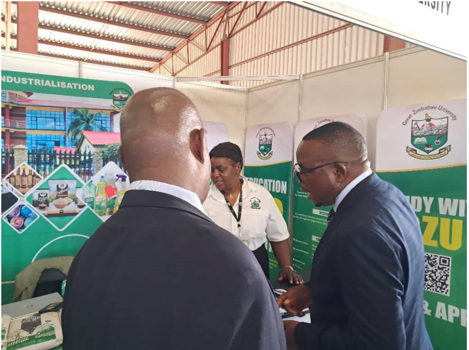
The Minister of Public Service, Labour and Social Welfare, Professor Mavima at the GZU stand at the Zimbabwe Agricultural Show

M oreso, the University was also part of the 114th edition of the Zimbabwe Agricultural Society and the Masvingo Agricultural Show exhibitions that came with numerous patrons having to visit the Great Zimbabwe University stand. The exhibitions provided a platform for the institution to interact with stakeholders and reaffirm its position as the University of Choice.