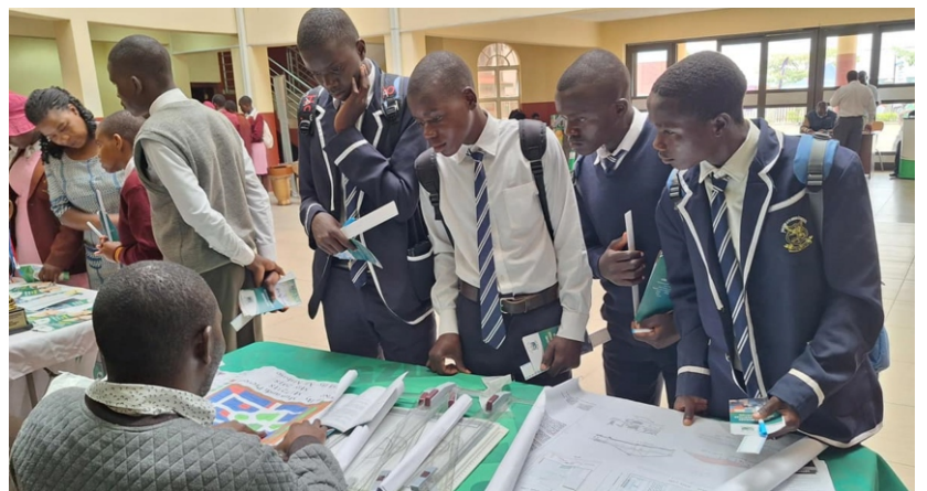
Student interactions with GZU staff