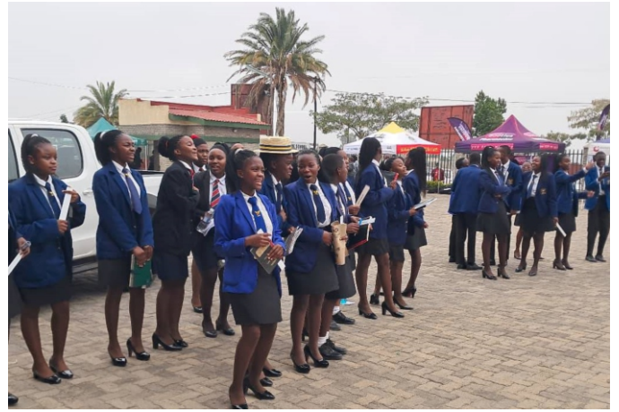
Thornhill High School students

Great Zimbabwe University campuses were transformed into a sea of colours as students from High Schools across the country thronged the country's premier institution of higher learning for the 2024 Open and Business Day.