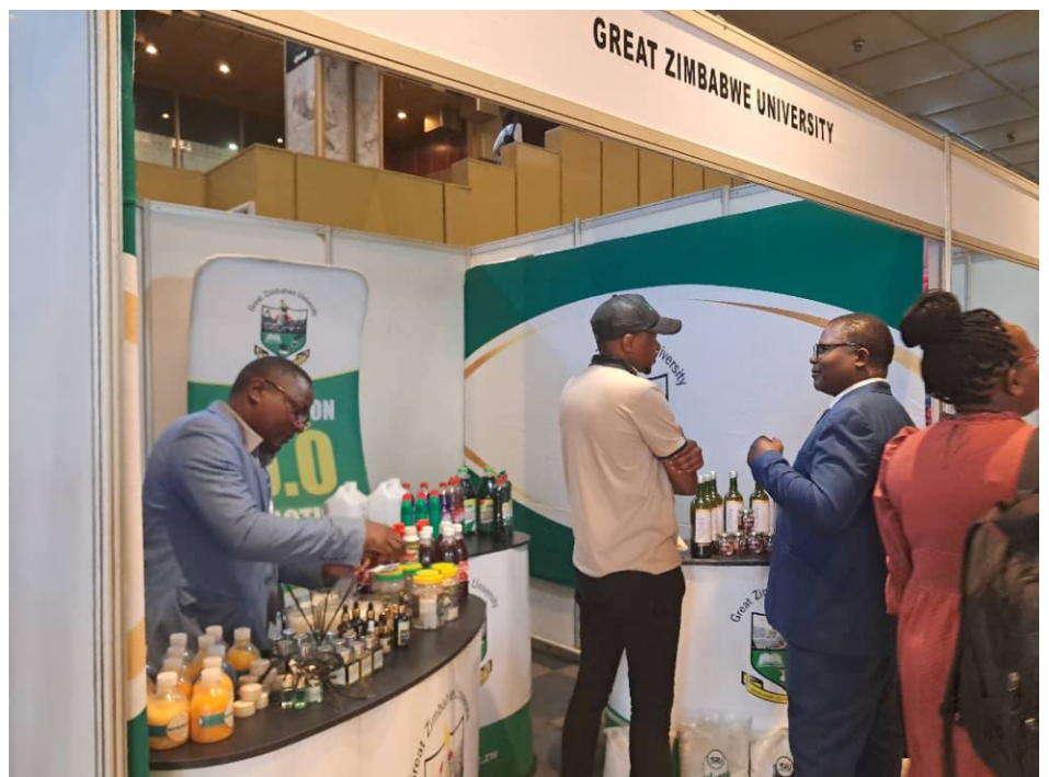
Part of the display at the International Research Symposium