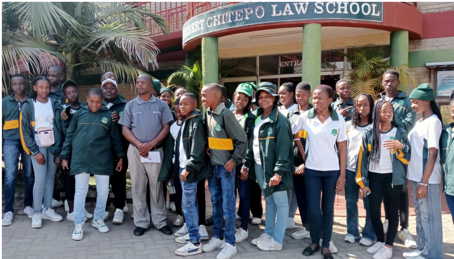
Waterfalls Academy students and teachers pose for a group photo