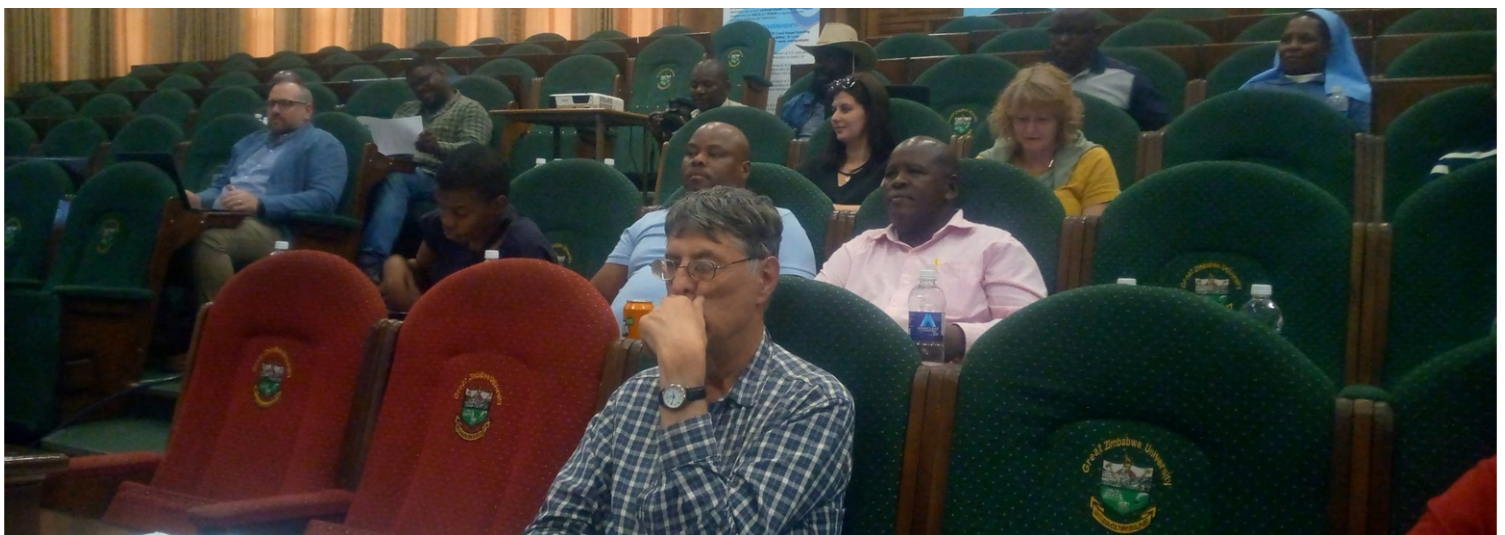
Members in attendance following proceedings

The conference was held at the Herbert Chitepo Law School Moot Court. The University of Choice welcomed participants from around the world who engaged in meaningful discussions and exchanges on church history and related topics.