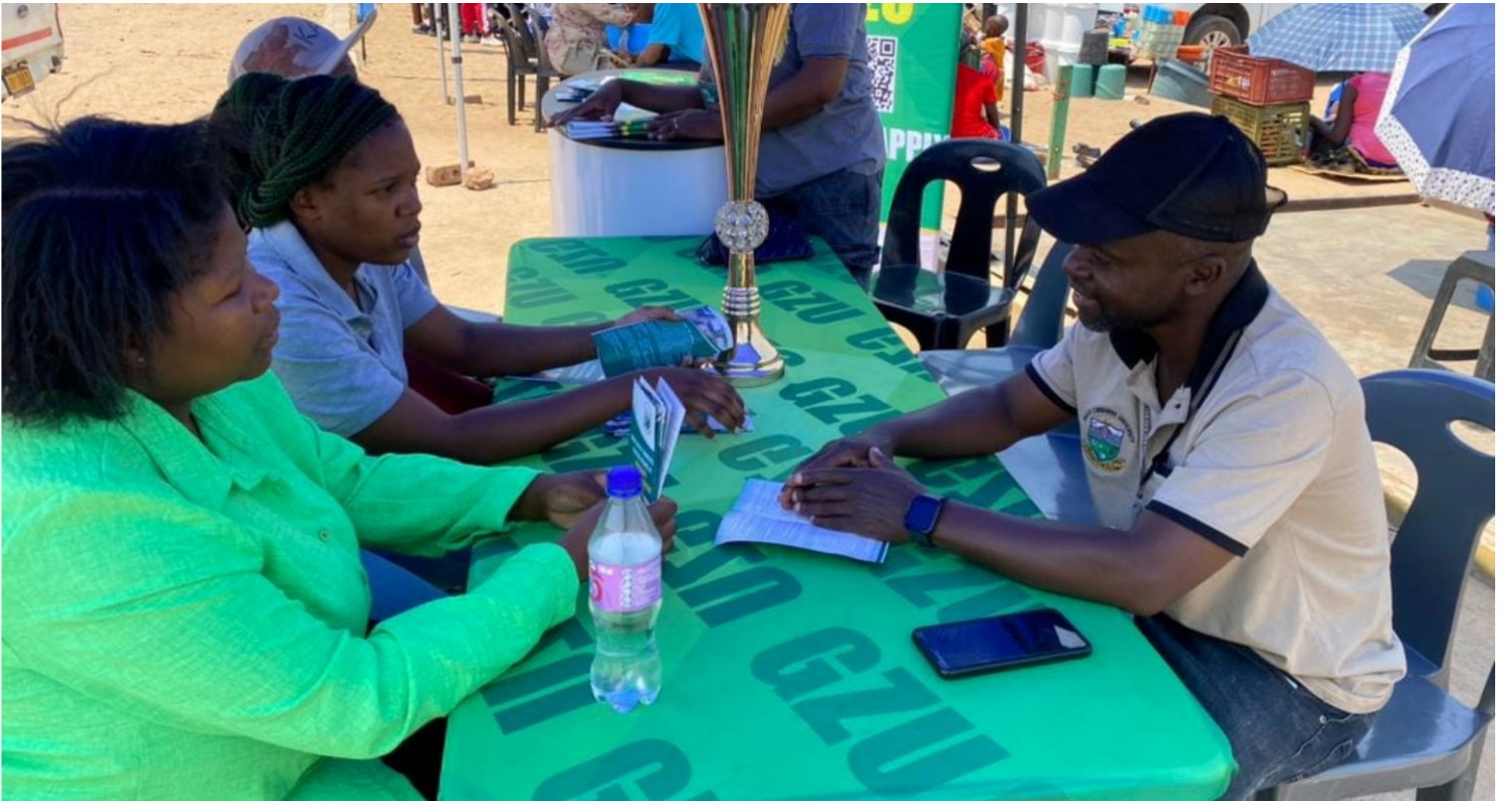
Gokwe Career Fair

Great Zimbabwe University has been astir with activity, hosting a series of career fairs, campus tours and attending exhibitions designed to inspire and inform prospective students and other stakeholders. The events aim to bridge the gap between academia and industry, providing students with valuable insights into their chosen career paths as well as building and maintaining relationships with the cooperate stakeholders.