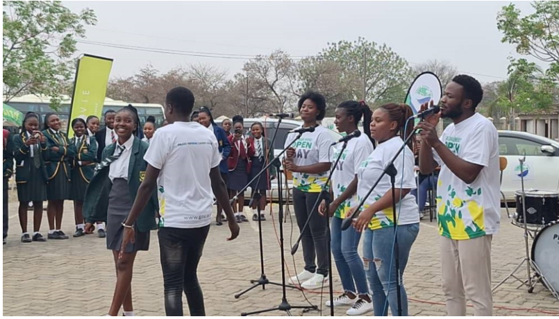
University Band performing at the Open Day