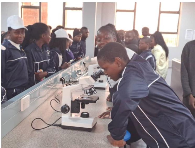
Perseverance Christian College at the Simon Mazorodze School of Medical and Health Sciences