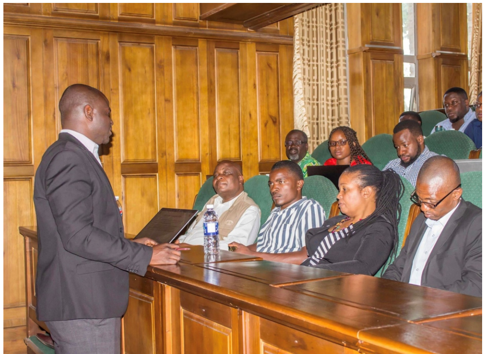
Session in progress

The presentations by various experts at the workshop underscored the urgent need for enhanced cybersecurity measures in Zimbabwe. It was agreed that by focusing on education, collaboration among stakeholders, and effective policy-making, it was possible to build a more resilient cyberspace that can withstand evolving threats.