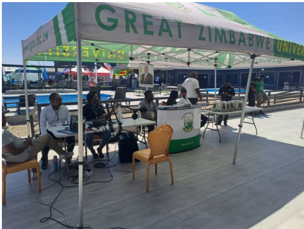
Great Zimbabwe University exhibition stand at the Business Expo

We celebrate another feather in our cap!