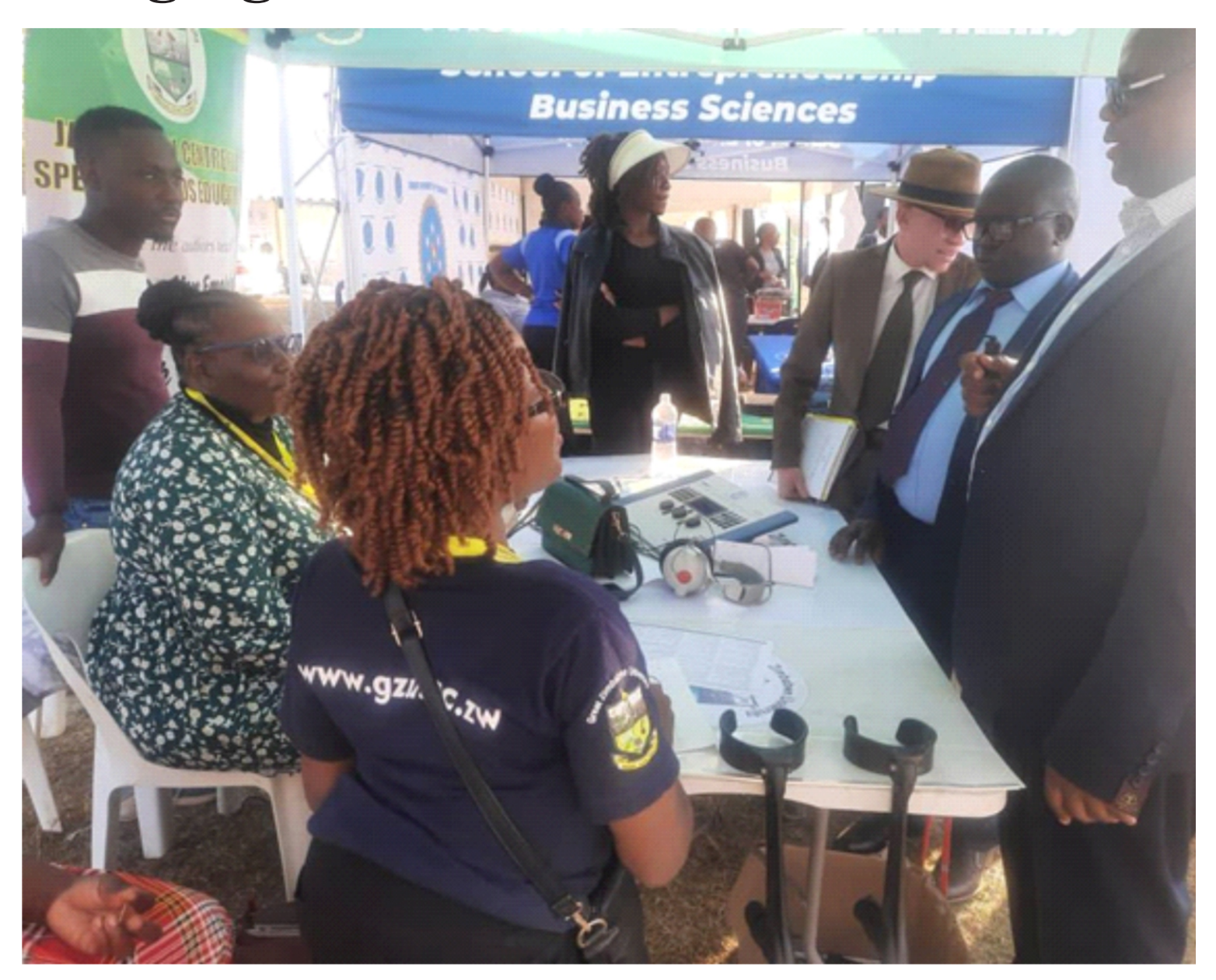
Interactions at the GZU exhibition stand

delegation from the University of Zambia (UNZA) visited the Great Zimbabwe University exhibition stand at the National Disability Expo, in order to find ways in which the two institutions of higher learning can strengthen inclusivity and diversity in their respective universities.