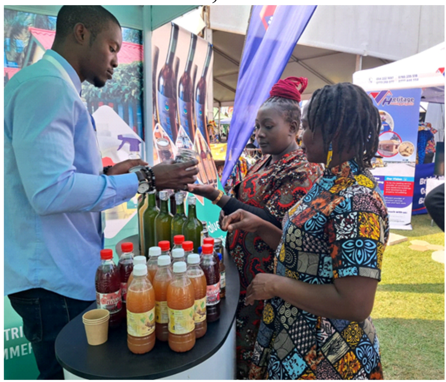
Visitors sampling various products at the GZU stand

reat Zimbabwe University exhibited at the 44th SADC Industrialisation Week, which took place at the Harare International Conference Centre in Harare from the 28th of July to the 2nd of August 2024. In alignment with Vision 2030 and the NDS1 mantra, the University showcased its innovative solutions to support the industrialisation of the nation and its goal of becoming an upper-middle-class income economy by 2030.