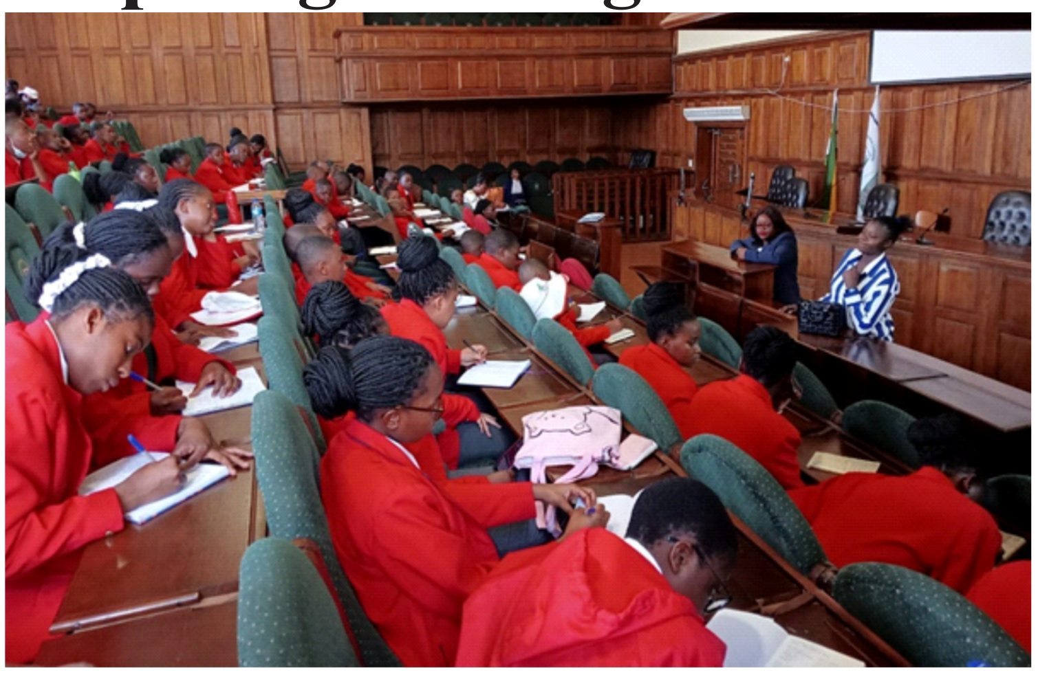
First Class High School student in the Moot Court

Mutare recently visited Great Zimbabwe University for a career guidance session. The event was aimed at inspiring and guiding students in their future careers.