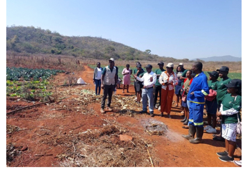
Desmondale Farm assessment

include, horticulture, apiculture, aquaculture, poultry who were satisfied with the preparations made by the university for the students to start the projects.