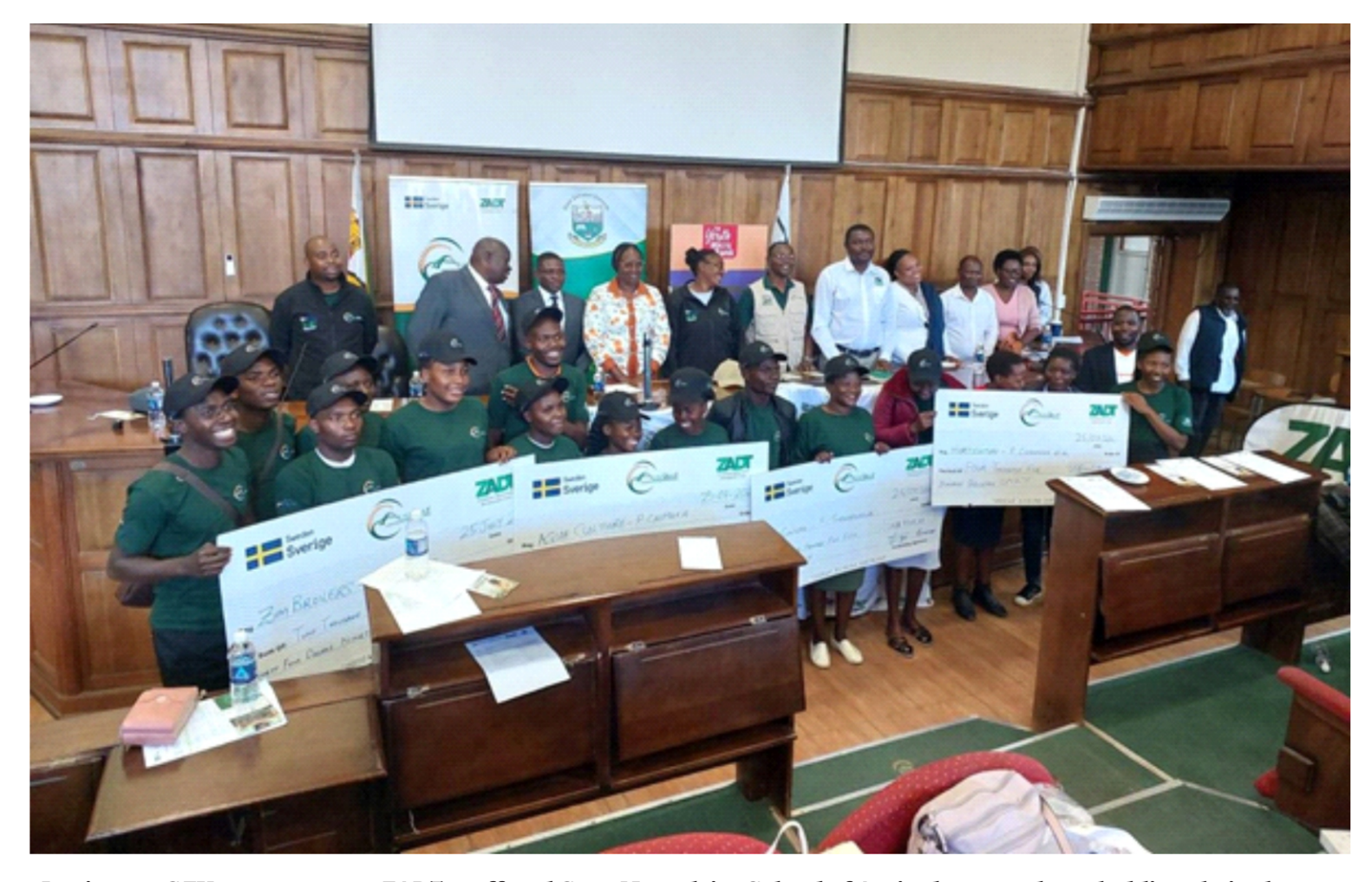
In\ picture:\ GZU\ management,\ ZADT\ staff\ and\ Gary\ Magadzire\ School\ of\ Agriculture\ students\ holding\ their\ cheques

ary Magadzire School of Agriculture students received business incubation grants from the CAUSEWAY project at the Business Incubation Launch held at the Herbert Chitepo Law School.