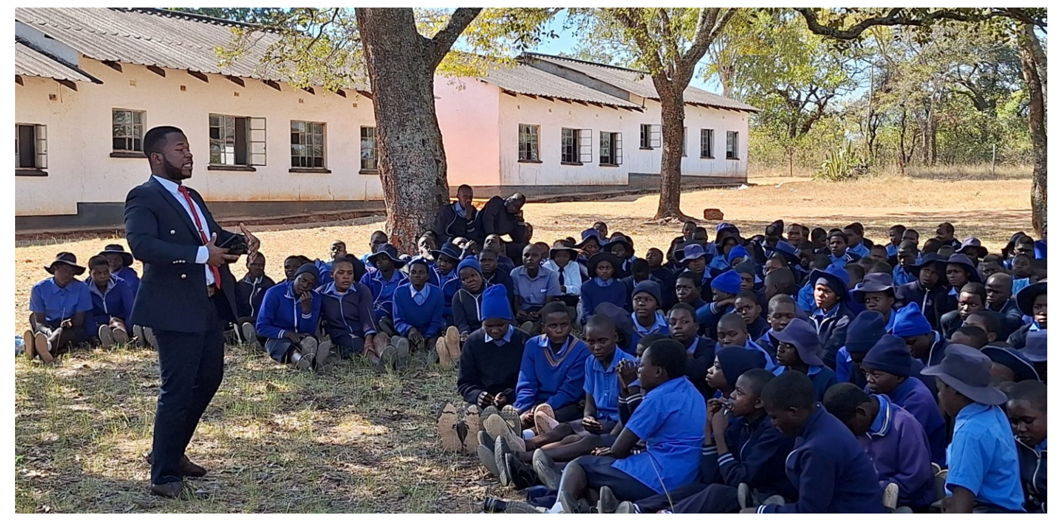
Law School student engaging with students from Rumwanda Secondary School

Province with a visit to Rumwanda Secondary School.