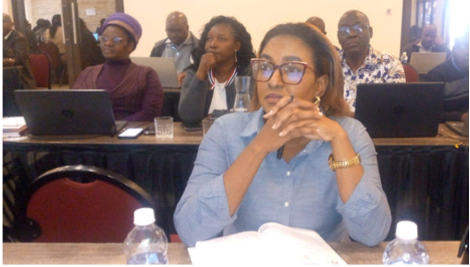
Management following training proceedings

he management team of Great Zimbabwe University participated in a Whole of Government Management Training Workshop which was scheduled to take place from 29 to 31 July 2024.