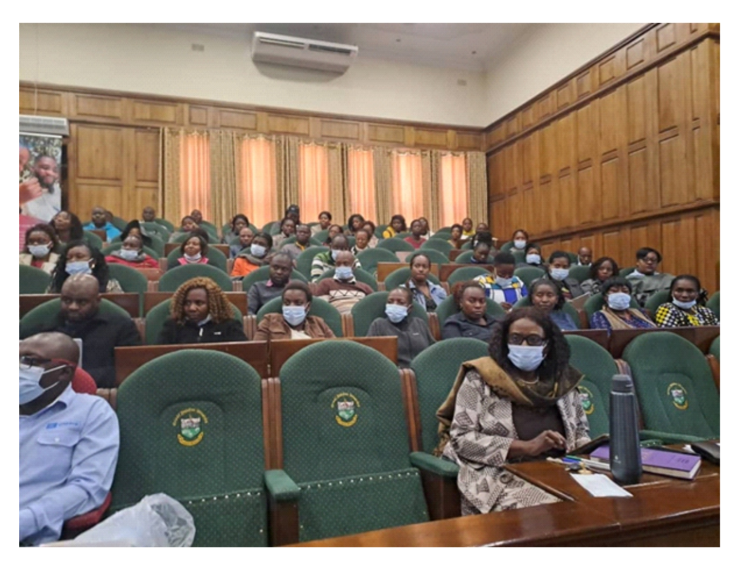
Members of Staff and students in attendance following proceedings

mployees of Great Zimbabwe University recently participated in a workshop focused on combating sexual harassment.