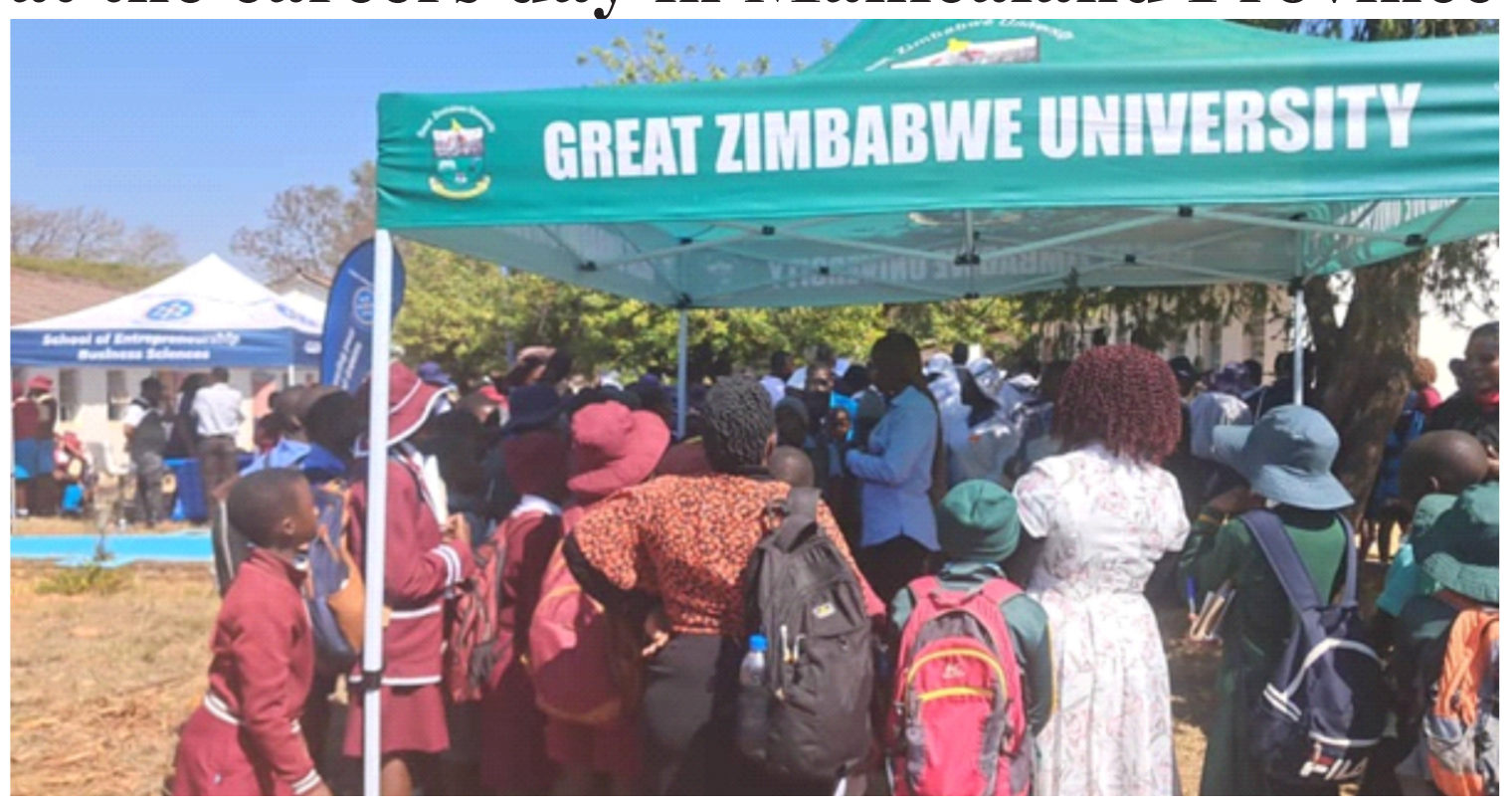
GZU officers addressing students at Gatsi High School in Honde Valley